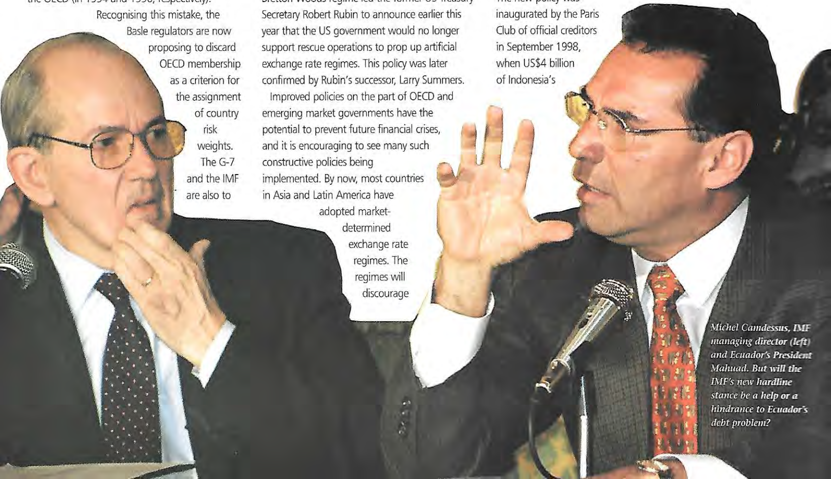
Michel Camdessus, IMF managing director (left) and Ecuador's President Mahuad. But will the IMF's new hardline stance be a help or a hindrance to Ecuador's debt problem?

However, it is discouraging to see the G-7 governments also adopting an uncompromisingly hard line towards private lenders and investors. This course will backfire, negating the benefits of the many constructive measures being put in place. Evidently, the G-7 governments have concluded that there is too much "moral hazard" in the international financial system – lenders and investors have grown so accustomed to being bailed out that they must now be disciplined – so that defaulting on obligations to private creditors has become a requirement for receiving support from the G-7. The new policy was inaugurated by the Paris Club of official creditors in September 1998, when US$4 billion of Indonesia's